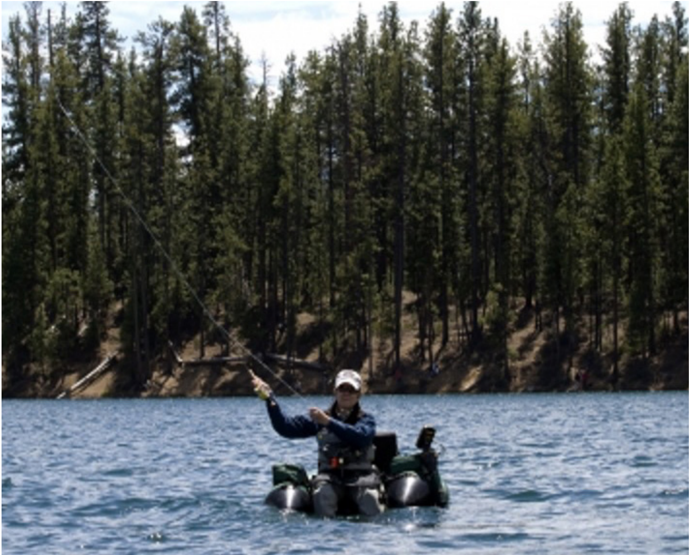
Trout angler on South Twin Lake

Fall fishing can be some of the best of the year. Trout and warmwater fish are more active in cooler water temperatures and more interested in food, especially with winter approaching. Summer steelhead fishing peaks while access to marine fisheries can be limited by heavy fall storms.