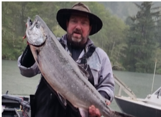
Siletz River Chinook

Tip for the season: Be patient while coho fishing in rivers; coho can be lure shy and it might take a while to dial in this fishery.