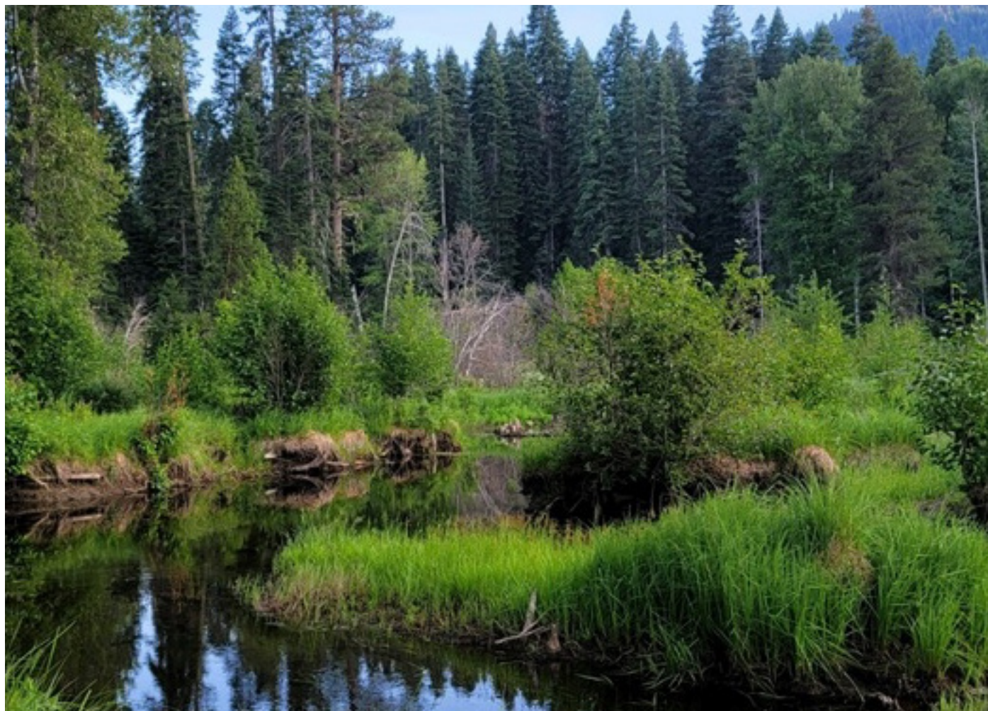
Marshal Moser Contributed this photo of a beaver pond. It is a stream at the base of the Cascades.