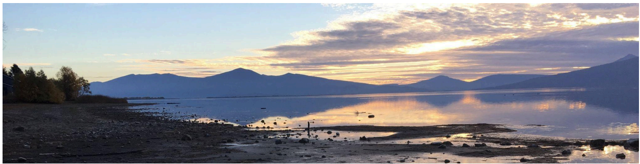
Along the banks of Agency Lake