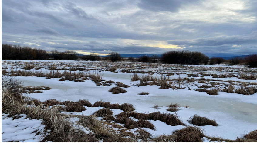
Upper Klamath Lake