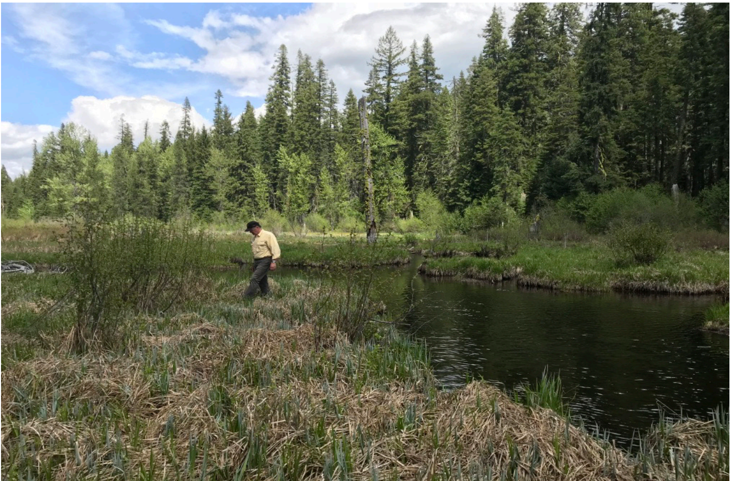
Sevenmile Creek, Ft. Klamath, OR