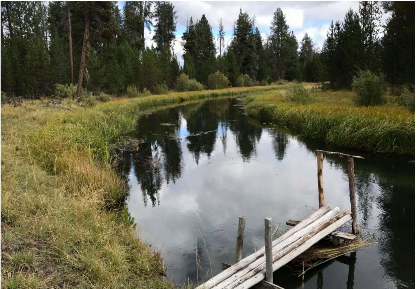
Upper Williamson River, Chiloquin, OR