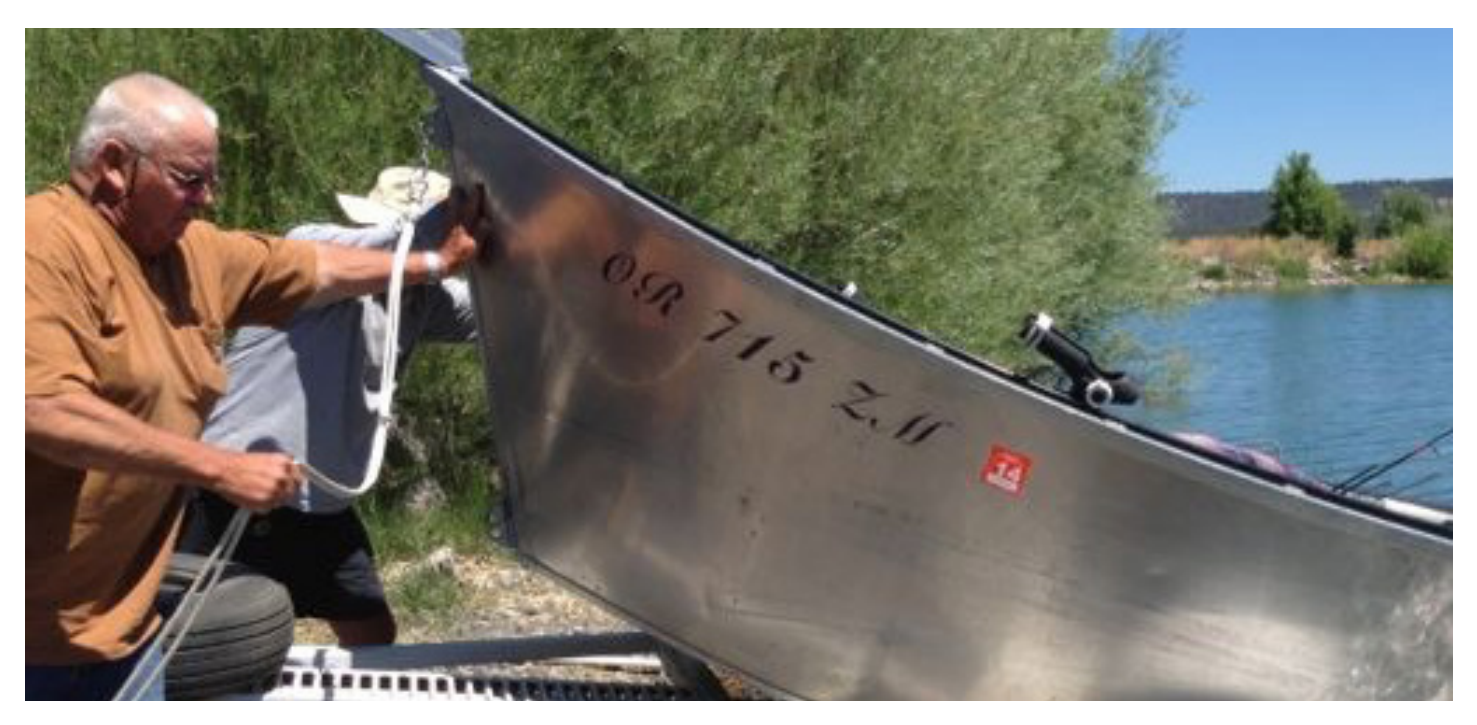
Bob Gregory at Pronghorn Lake Ranch