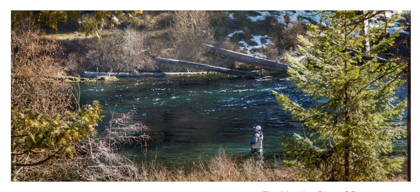
The Metolius River, OR