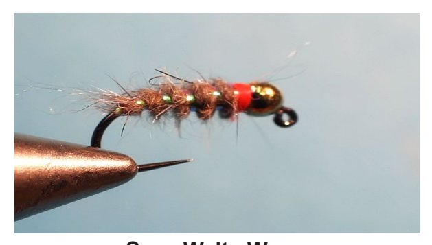
Sexy Walts Worm